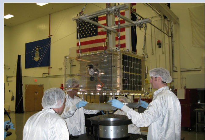
BHT-200 Integrated on FalconSat-5